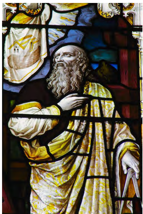
Figure 3. Noah Sees the Ark in Vision. Detail of Patriarchs Window, Holy Trinity Church, Stratford-upon-Avon, England9

Resemblances between the Ark and the Tabernacle. It is significant that, apart from the Tabernacle of Moses10 and the Temple of Solomon,11 Noah's ark is the only man-made structure mentioned in the Bible whose design was directly revealed by God.12 In this image, God shows the plans for the Ark to Noah just as He later revealed the plans for the Tabernacle to Moses. The hands of Deity hold the heavenly curtain as Noah, compass in his left hand, regards intently.