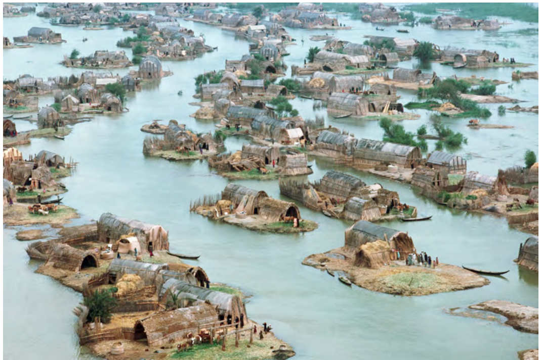
Figure 5. Nik Wheeler, 1939-: Marsh Arab Village, 1974

• Reeds. Although reed-huts may sometimes serve as secular enclosures, references to them in Mesopotamian flood stories clearly point to their ancient use as divine sanctuaries.34 In a Mesopotamian account of the flood story, Ziusudra enters into a "reed-hut... temple,"35 where he stands "day after day" listening to the "conversation" of the divine assembly.36 Eventually, Ziusudra learns that the council of the gods have decided to destroy mankind by a devastating flood. Regretting the decision, the god Enki warns Ziusudra and instructs him on how to build a boat. Similar to ancient Near East parallels where the gods whisper their secrets to mortals standing on the other side of temple veils separating the divine and human realms,37 Enki conveys his message privately through a thin wall of the sanctuary.38 Related accounts tell us that Enki instructed Ziusudra to tear down the reed-hut temple and to use the materials to build a boat.39