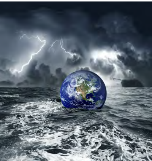
Figure 6. The Ark as a Mini-Replica of Creation47

Despite its ungainly shape as a buoyant temple, the Ark is portrayed as floating confidently above the chaos of the great deep. Significantly, the motion of the Ark "upon the face of the waters"44 paralleled the movement of the Spirit of God "upon the face of the waters"45 at the original creation of heaven and earth. The deliberate nature of this parallel is made clear when we consider that these are the only two verses in the Bible that contain the phrase "the face of the waters." In short, we are made to understand that in the presence of the Ark there has been a return of the same Spirit of God that had hovered over the waters at Creation — the Spirit whose previous withdrawal had been predicted in Genesis 6:3.46